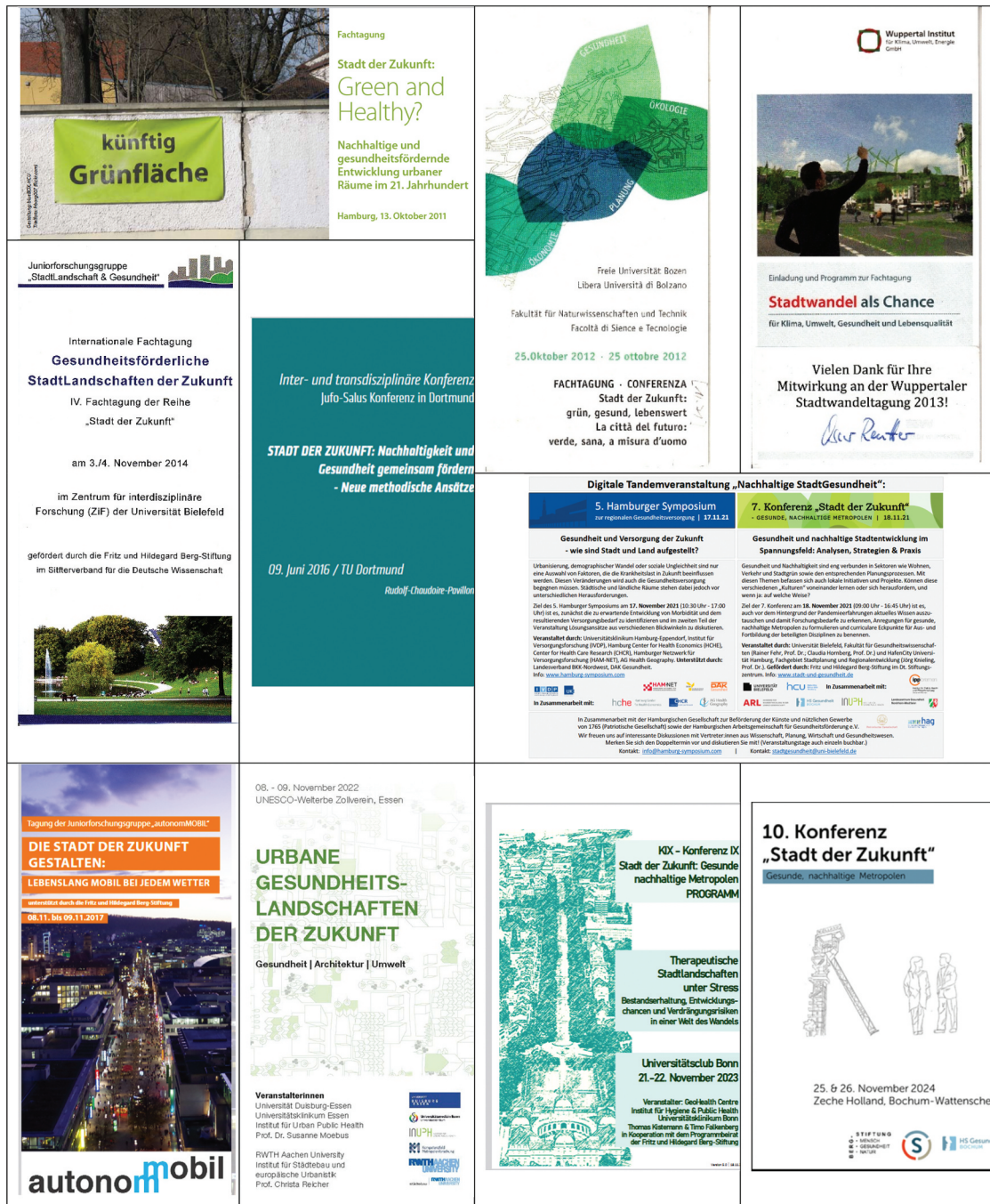
Figure 2. Flyers of the (bi-)annual conferences within the “City of the Future” program.